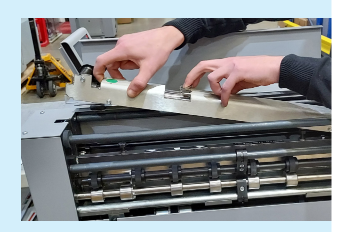
Removing the 'EasyBlade' safety cover.