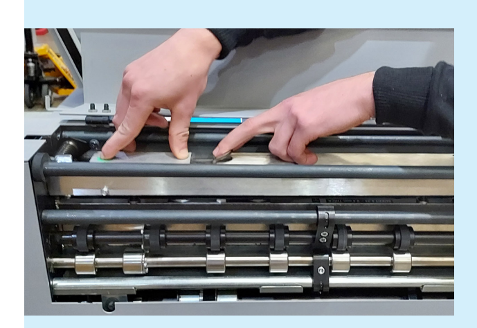
EasyBlade quick release mechanism.